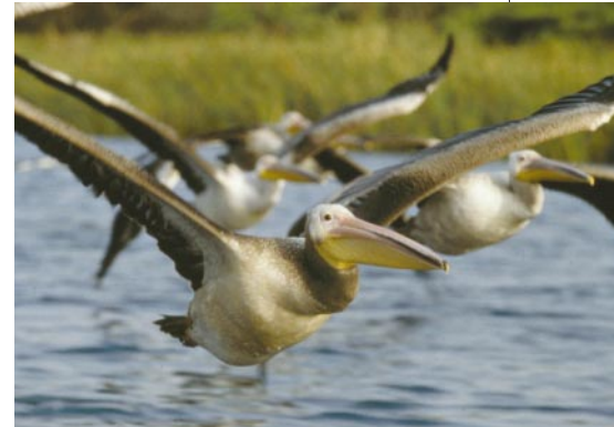
Figure 1 Great white pelicans flying in formation over a river.

Our results provide empirical evidence that, compared with solo flight, formation flight confers a significant aerodynamic advantage which allows birds to reduce their energy expenditure while flying at a similar speed. In birds flying in formation, each wing moves in an upwash field that is generated by the wings of the other birds in the formation. Modelling has shown that when birds are flying with optimal spacing, a maximal reduction in power can be achieved 3 and total transport costs can be substantially reduced 2 . However, field observations of V formations indicate that birds often shift from their optimal positioning, perhaps in an attempt to maximize