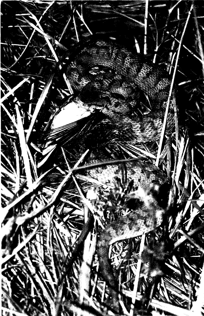
Figure 3. A Shedao pitvipiper, Gloydus shedaoensis , swallowing a bird.