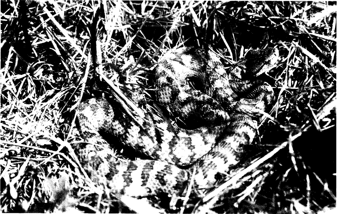
Figure 4. A Shedao pitviper, Gloydius shedaoensis , in typical terrestrial foraging pose.

whereas that between males and females is not ( \chi^2 = 1.05 , df = 1 , P = 0.31 ). The lower rate of feeding in juvenile snakes may result from gape-limitation: juvenile snakes are unable to ingest most bird species in the area (Li et al. 1990).