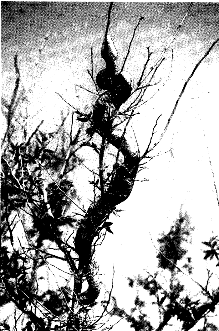
Figure 1. The Shedao pitviper, Gloydius shedaoensis , in a typical arboreal foraging pose.

Shedao (literally, "snake island") lies approximately 13 km (7 nautical miles) off the coast of the Liaodong Peninsula in northeastern China, in the Bohai Sea (38°57' N, 120°59' E). The island is 0.73 km 2 in overall size, and is very steep-sided. The highest peak on the island is 215 m above sea level.