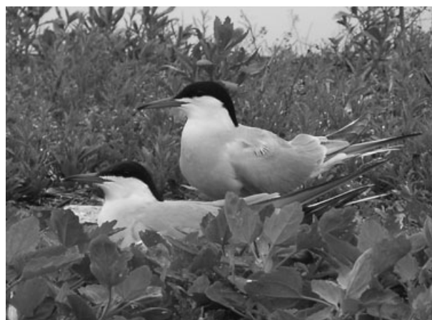
Fig. 1. A pair of incubating common terns ( Sterna hirundo ) on Bird Island, MA, USA.

To examine whether age influenced stress-induced levels of PRL and CORT, we identified and marked nests during the laying period and captured one known-aged adult per nest using walk-in treadle traps