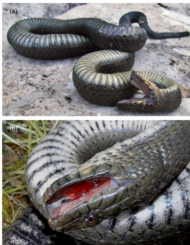
Figure 1 Photographs of dice snake from Golem Grad population performing death feigning (a) and blood spitting (b). [Colour figure can be viewed at zslpublications.onlinelibrary.wiley.com .]

Snakes were subsequently removed from the bag and processed in a standard way for behavioural observations. Morphological measurements were performed afterwards (see below). Individuals were seized at mid-body and taken out of the bag, mimicking a successful attack from a predator. Antipredator responses were immediately recorded. It was not possible to standardize factors such as body temperature, weather conditions, lighting, time of measuring or proximity to refuges. Although these factors might affect antipredator behaviours, they were partly randomized through the distribution of field sessions across seasons and years in different sites.